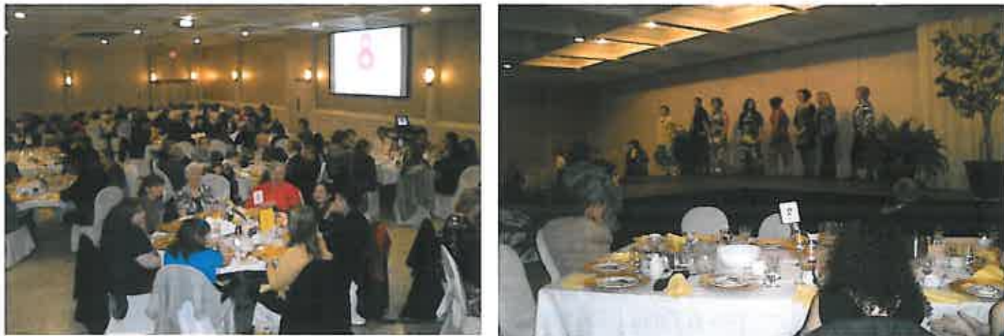
The FFWA's "Giorno della Donna" banquet featured a fashion show highlighting fashions from Linda's Fashions & Accessories.

The Women's Association is looking forward to and already planning next year's celebration of IWD 2014.