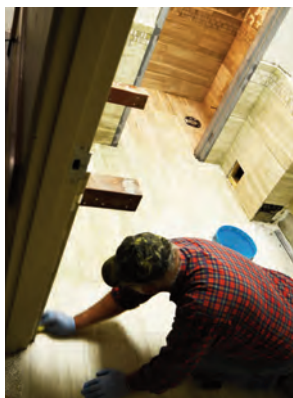
Fausto sealing the floor tiles in the new North Hall bride & groom room.

The next couple of months will be busy, indeed, at the Fogolar, with a host of special events on the slate. In May, we will host our annual Mother's Day brunch. What a wonderful way to honour "Mom"! In June, we will honour our fathers during a special Father's