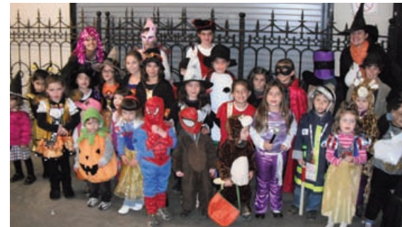
Trunk & Treat on Friday, October 28